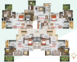
2 nd , 4 th & 6 th FLOOR PLAN