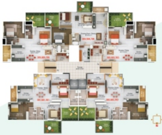
3 rd , 5 th & 7 th FLOOR PLAN