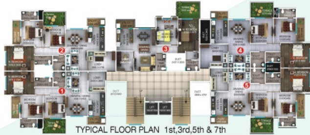
TYPICAL FLOOR PLAN 1st,3rd,5th & 7th