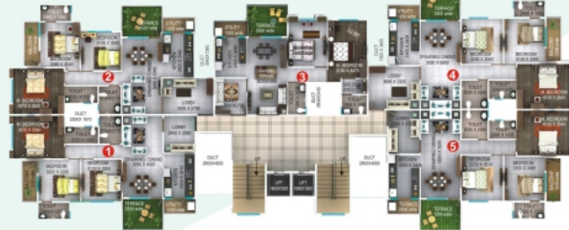
TYPICAL FLOOR PLAN 2nd,4th & 6th