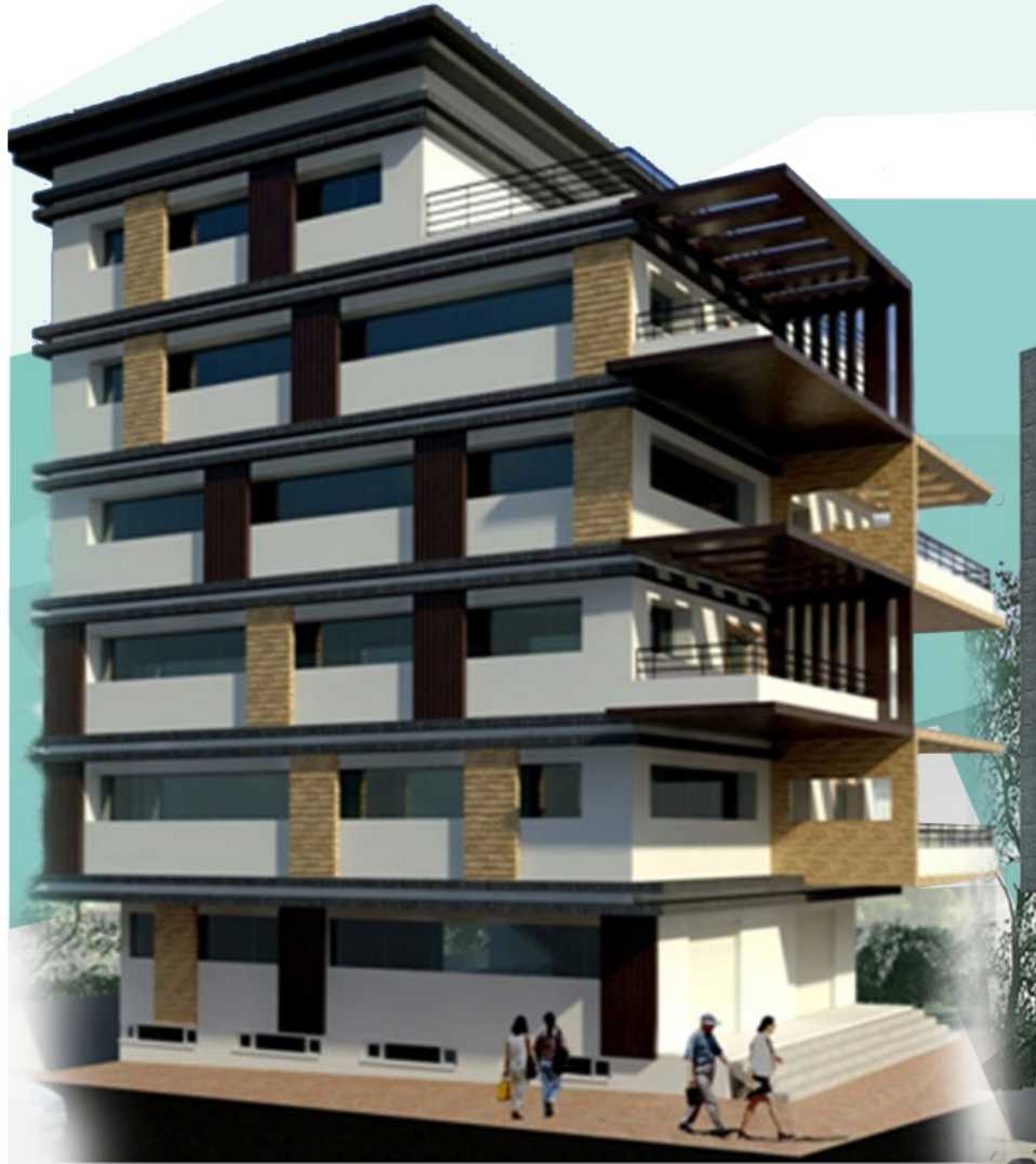
COMPLEX AT JARIPATKA