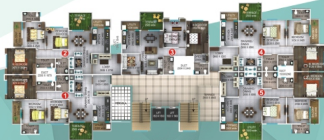
FLOOR PLAN 8th